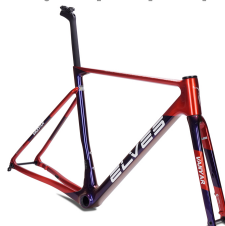
Chameleon(Navy Blue)&Transparent Red