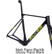
Matt Piano Black&Glossy Piano Black