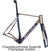
Chameleon(Forest Green)&Champaign Golden