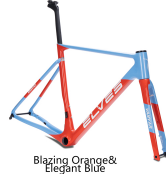
Blazing Orange&Elegant Blue